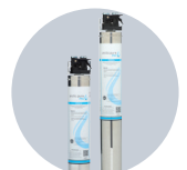
Arctic Pure Water Filters