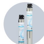
Arctic Pure Water Filters