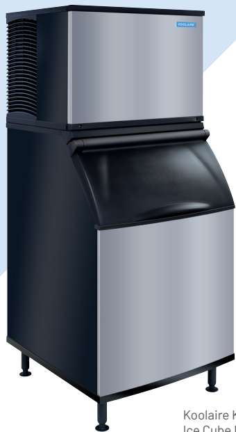
Koolaire KP0500 Ice Cube Machine on K-570 Bin