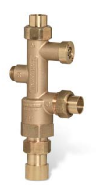
Shrink installation time and grow your bottom line.