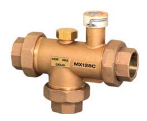
MX Series™ High Capacity Mixing Valve is specifically designed for larger applications — giving you larger results.