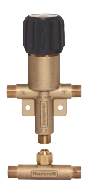
The smart way to add safety at every faucet.