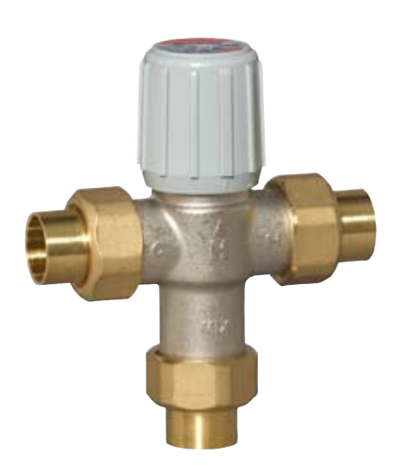
Designed to provide scalding protection and up to 50 percent more usable hot water.