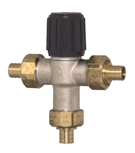
Meets new rigid plumbing codes.